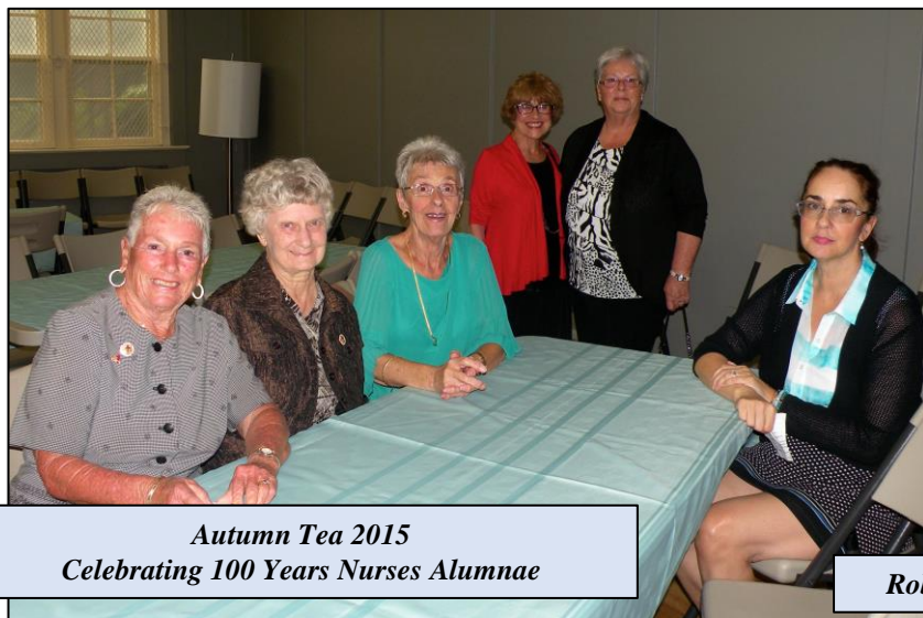
Autumn Tea 2015 Celebrating 100 Years Nurses Alumnae