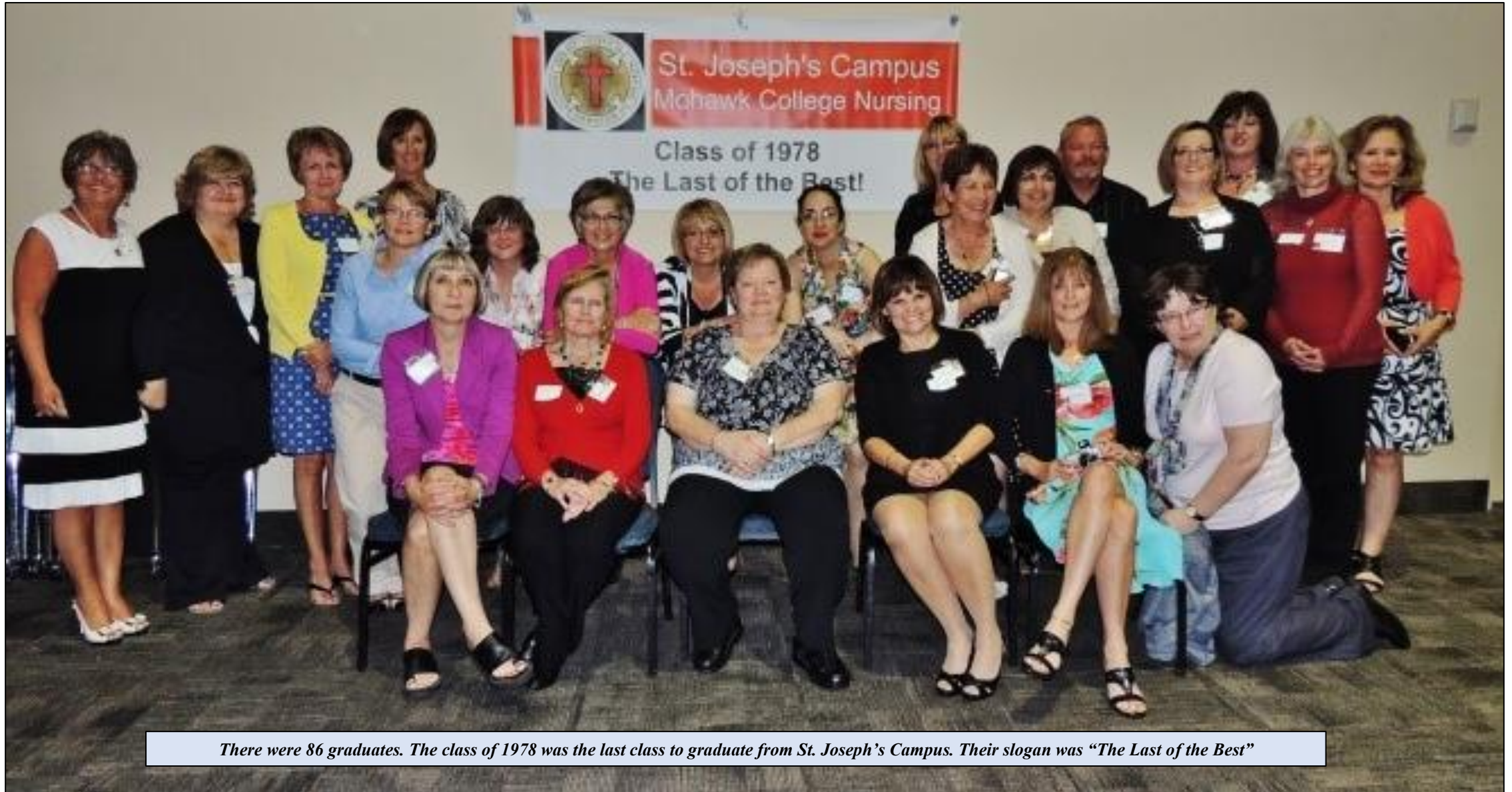
There were 86 graduates. The class of 1978 was the last class to graduate from St. Joseph's Campus. Their slogan was "The Last of the Best"