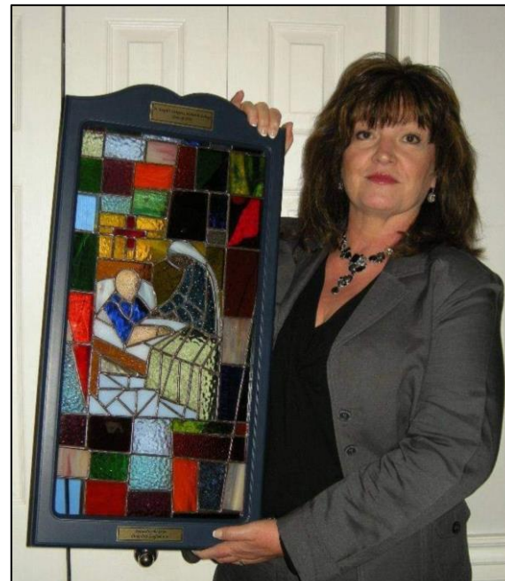
Stained Glass was created by Cindy Croft Knoflook The class of 1978 also made a cash donation to the alumnae